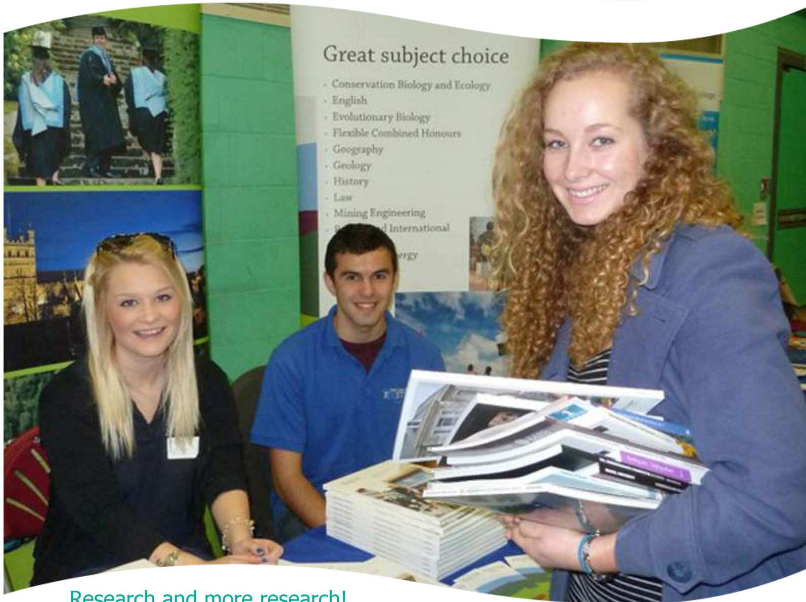
Research and more research!